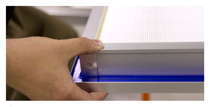
A) Using two people and being careful not to contact filter media raise the filter into place.