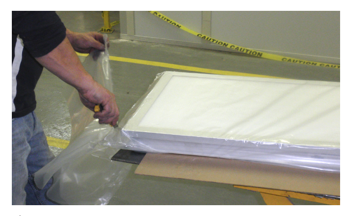
C) Cut plastic bag and remove with care.