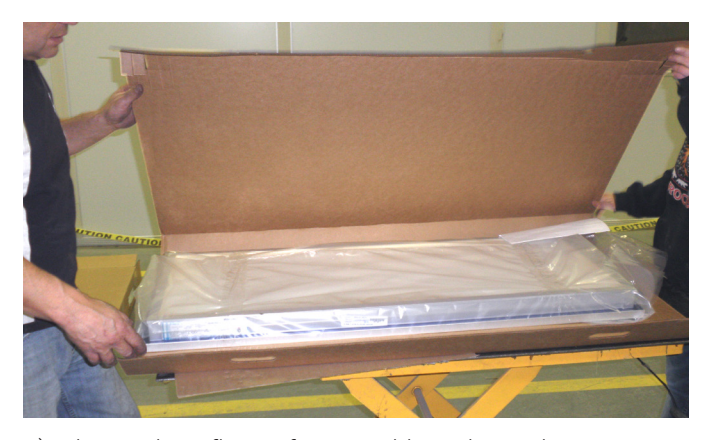
B) Place unit on flat surface or table and open inner packaging.