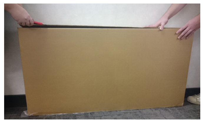
A) Carefully cut open box and remove inner filter packaging. Avoid applying pressure to filter while handling packaging.