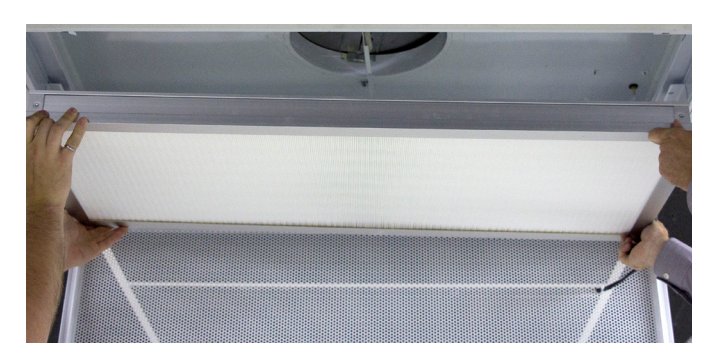
B) Ensure knife edge of plenum seats into gel channel. Use guides to assist with proper knife edge alignment.