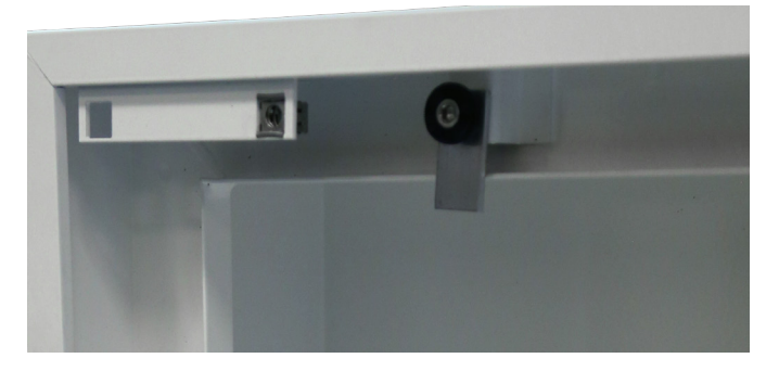
A) Loosen cam locks.