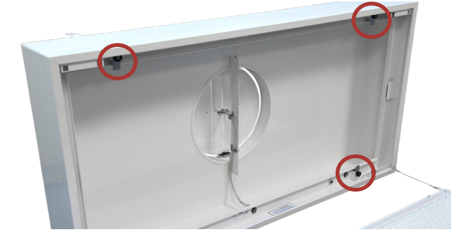
B) Note location of filter alignment guide (minimum one per side, dependent on size).