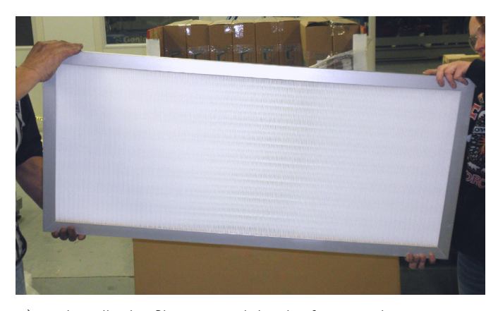
D) To handle the filter, grasp it by the frame only.